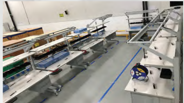
▶ Nawah Newclear Polver Plant ESD Furniture