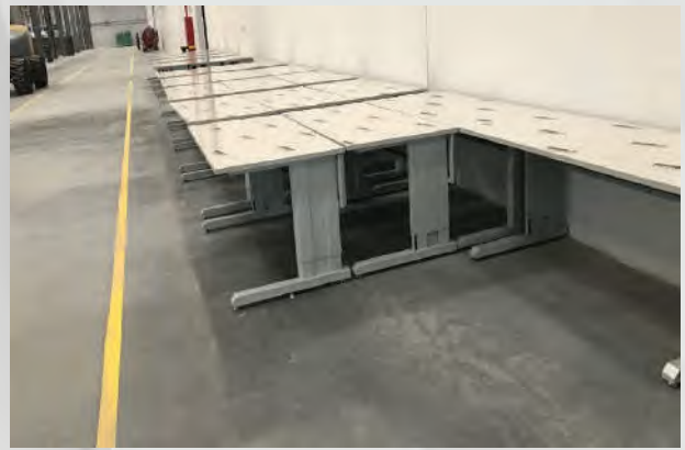
▶ Noon.com, UAE ESD Furniture