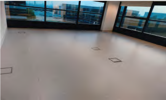
▶ Smart Choice Mobile FZCO ESD Flooring