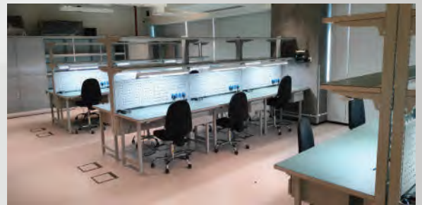
▶ Mohammed Bin Rashid Space Centre (MBRSC) ESD Floor & Table Mat, ESD Furnitures