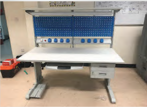
▶ Dubai Airport, UAE ESD Furniture