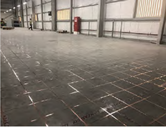
▶ HUAWEI ESD Flooring