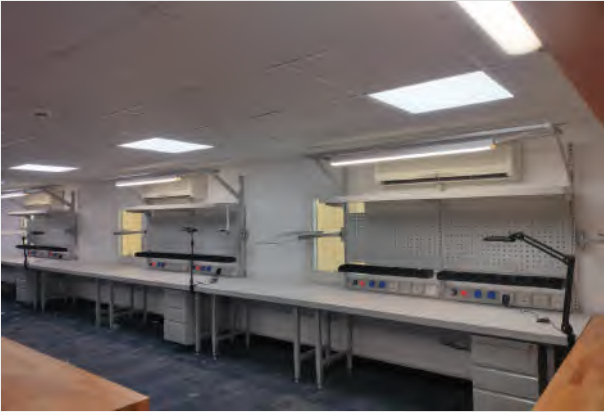
▶ Abu Dhabi Autonomous Systems Investments (ADASI) ESD Flooring & ESD Furniture