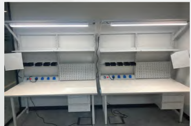
▶ Yamaha Music ESD Furniture