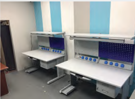
▶ National Ambulance ESD Furniture